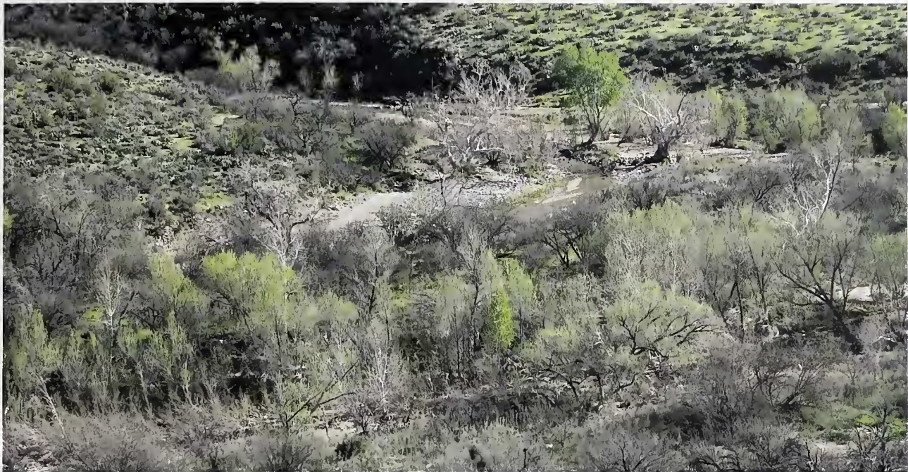
Figure 2 Riparian forest at the confluence of Sycamore Creek and Mesquite Wash in Arizona where aggregations of B. philenor were observed.

area of about 2 m on a side) and recorded the time at which the aggregation was first observed. On two mornings, we also recorded the time at which each individual left the aggregation. We obtained the sunrise or sunset time for each observation day from the NOAA calculator ( http://www.srrb.noaa.gov/highlights/sunrise/sunrise.html ), and compared all observed times to sunrise (for morning observations) or sunset (for evening observations).